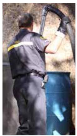
USED OIL/OIL FILTER COLLECTION