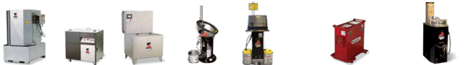
MODEL FL500 Automated Spray Cabinet MODEL 3523 Ultra Sonic Agitating Ultra Sonic MODEL 1077 Manual Paint Gun REVO 3000® Automatic Paint Gun MODEL 275 Solvent Recycling for legacy equipment MINIMIZER III Waste Minimizing

High pressure. For thorough, precise cleaning, nothing beats ultrasonic. Save time and extend the life of your equipment. Cleaner solvent between services. Reduces waste disposal needs. Reduces waste disposal needs.