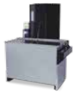
MODEL 81.8 Immersion Agitation

Our full line of manual parts washers are available with solvent or aqueous chemistries.