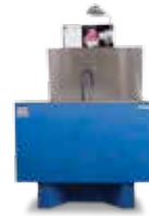
MODEL 91 Manual Vat