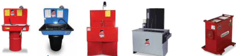
MODEL 30/16 Manual Sink