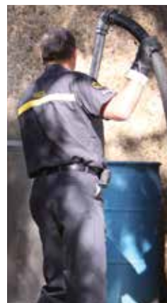
USED OIL/OIL FILTER COLLECTION