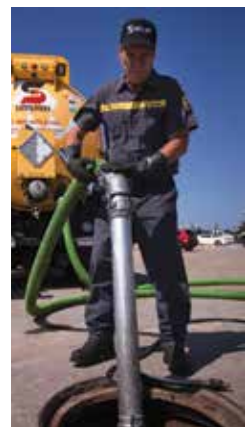
VACUUM TRUCK SERVICES

SAFETY-KLEEN.COM | (800) 669-5740 PRINTED ON RECYCLED PAPER ♻️