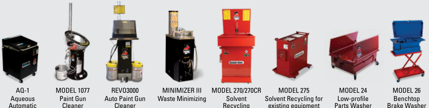
AQ-1 Aqueous Automatic