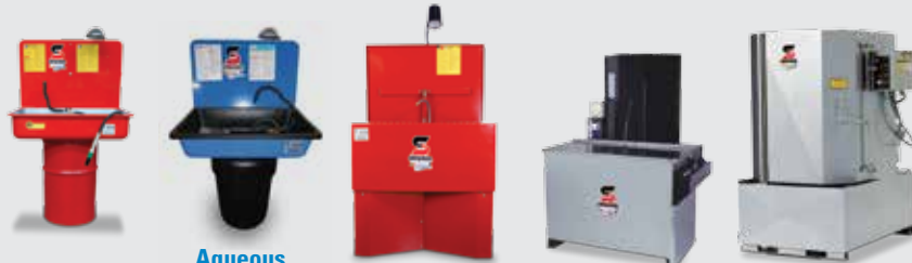
MODEL 30 Manual Sink

After more than 50 years, Safety-Kleen continues to lead the Parts Washing industry by providing unrivaled service and top-notch equipment to help meet your performance demands. With our extensive line of manual and automated equipment, our high performance solvent and aqueous chemistries and superior service, we can provide the customized program your cleaning needs demand.