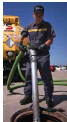
VACUUM TRUCK SERVICES