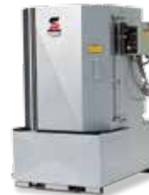
JRI FL500 Front Load