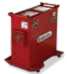
MODEL 275 Solvent Recycling for existing equipment