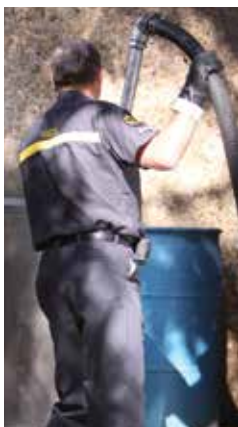
USED OIL/OIL FILTER COLLECTION

If your company is looking for efficient and environmentally responsible ways to handle cleaning and waste, call Safety-Kleen.