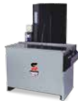
MODEL 81.8 Immersion Agitation