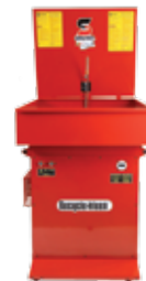
MODEL 270/270CR Solvent Recycling