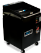
AQ-1 The ultimate in flexibility