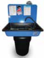
MODEL 90/94 Aqueous Manual Sink

After more than 50 years, Safety-Kleen continues to lead the Parts Washing industry by providing unrivaled service and top-notch equipment to help meet your performance demands. With our extensive line of manual and automated equipment, our high performance solvent and aqueous chemistries and superior service, we can provide the customized program your cleaning needs demand.