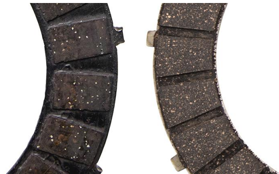
Left: Wear damage derived from using an engine oil that does not provide adequate protection. Right: Wear protection provided by Performance Plus.

The greatest amount of wear occurs at low temperature start-up and Performance Plus® engine oils are formulated to protect critical engine components to extend engine life.